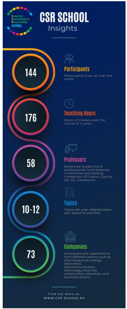
AHEAD - The Alba Hub for Entrepreneurship and Development

During the 10 webinars, 45 participants attended lectures by 21 distinguished expert speakers, discussed relevant case studies, learned about best practices and exchanged views and thoughts around the incorporation of relevant theory into the CSR