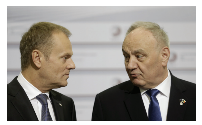
Moldova's President Nicolae Timofti (R) speaks to European Council President Donald Tusk as they pose for the media before the Eastern Partnership Summit session in Riga, Latvia, May 22, 2015.

Moldova's political future and Moscow's prospects for increasing its influence in the country are clouded by the crisis next door in Ukraine. Moldova's breakaway Transdniestrian region is in deep economic crisis (even worse than Moldova), with an exodus of the working-age population exceeding even that in Moldova proper. Transdniestrian leader Evgeniy Shevchuk recently admitted that Tiraspol has funds for barely half