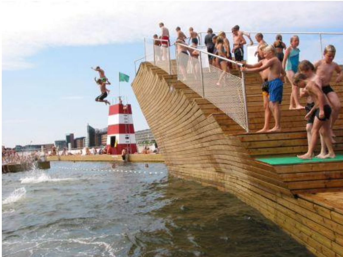
HARBOUR BATH - COPENHAGEN