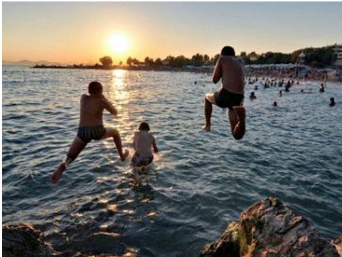
GLYFADA BEACH - ATHENS