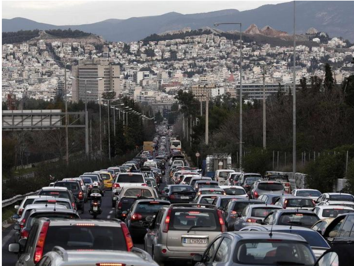
TRAFFIC JAM ATHENS..